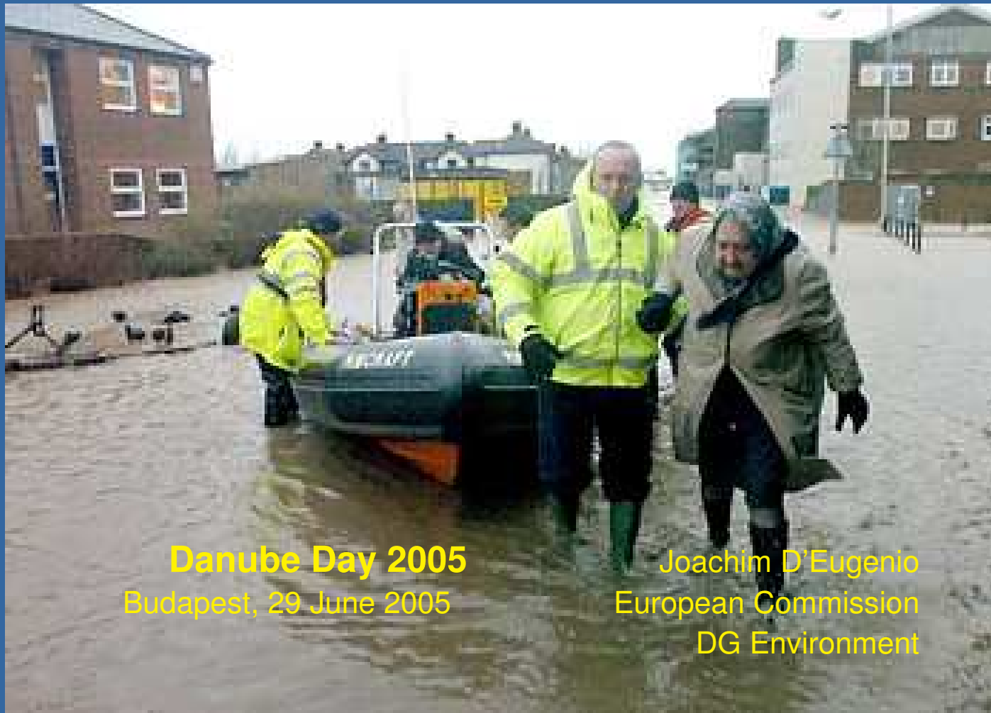
Danube Day 2005 Budapest, 29 June 2005